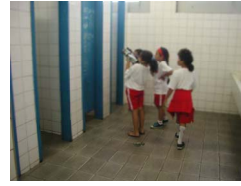
Figure 2- Investigative journalists

The youngest original participants were from a second-grade classroom, also in a poor section of the north zone of São Paulo. For a group of girls, the biggest problem in São Paulo was for them to go to the bathroom in the school. It was dirty, graffiti-filled, had no toilet paper, and they were often harassed by boys. Their idea was to create "The Bathroom that We Want." They created a photo-journalist essay on the travails of going to the bathroom. When the deputy mayor saw their project, he committed to paying more attention to the school bathrooms in his jurisdiction.